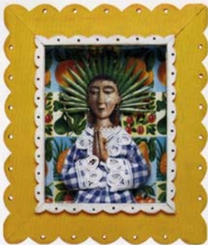
Our Lady of Somows in a Blue Checked Dress