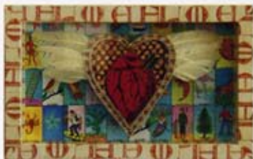
The Dream said: Be Careful For Your Heart